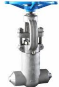
Forged steel self sealing butt welding globe valve