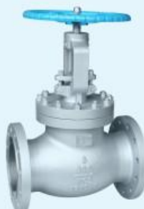
BS1873 Globe valve