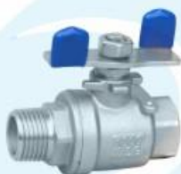
Butterfly type inner and outer ball valve