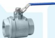
2PC threaded ball valve