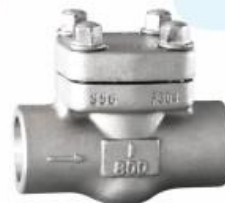
Forged steel butt welding check valve