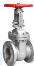
Stainless steel Gate valve