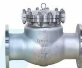
SS Check valve

Material WCB WCC LCB CF8 CF8M CF3M WC6 WC9 C5 C11 C12 A105 LF2 F11 .....F22 F55