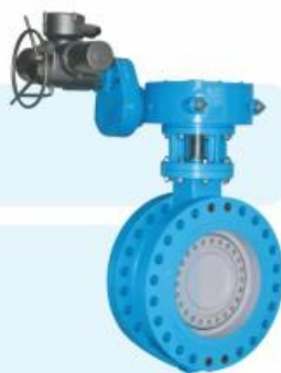
API/JIS butterfly valve 40A-300A• SCPH2/SCS13/SUS304/SCS14 •SUS316• 10K-40K JISB JISB2002 JISB2003 API609