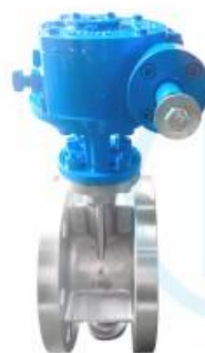
API609 butterfly valve DN15-DN100•1.4408•SUS304•X5GrNiMo1712-2 BS5351 MSS SP-118 DIN3354 ANSI B16.5