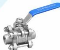
3PC butt welded ball valve