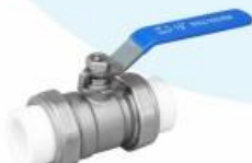
2PC ball valve with connecting pipe