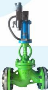
Electromagnetic globe valve