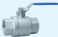
2PC German standard threaded ball valve