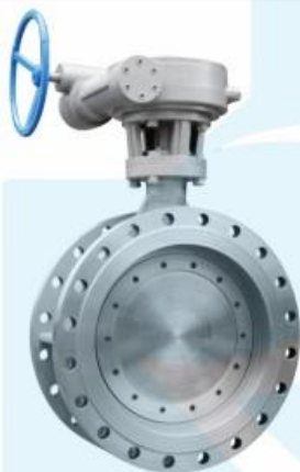
Stainless steel butterfly valve DN50-DN1200•WCB/CF8/SUS304/1.4408 GB/T12238 GOST API609