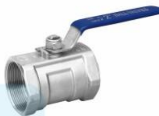
1PC threaded ball valve