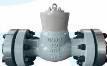
Rotary flanged check valve