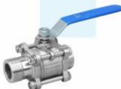
3PC inner and outer ball valve