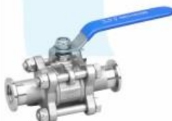
Vacuum ball valve