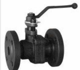
Forged steel flange ball valve