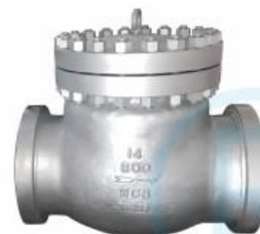
WCB API Flange check valve