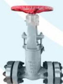
GOST Gate valve