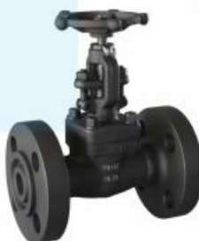
Forged steel flange globe valve