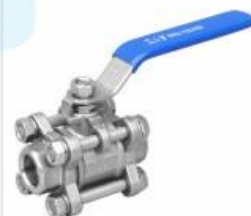
3PC socket welding ball valve