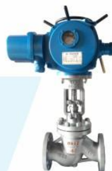
Electric globe valve

Material WCB WCC LCB CF8 CF8M CF3M WC6 WC9 C5 C11 C12 A105 LF2 F11 .....F22 F55