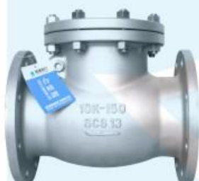
SCS13 JIS Flange check valve