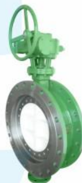
Steel butterfly valve 1/2"-8"• QT450/CF8/CF8M•150# PN16 10K AWWAC504 API609 DIN3354 BS5155