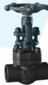
Forged steel threaded globe valve