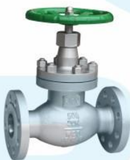
LNG Globe valve