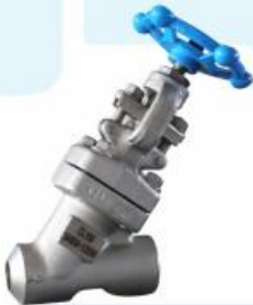
Forged steel Y-shaped globe valve