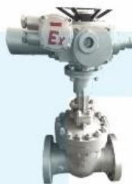
Electric gate valve