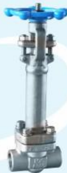
Forged steel low-temperature butt welding gate valve