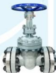
DIN Gate valve