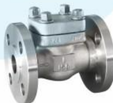
Forged steel flange check valve