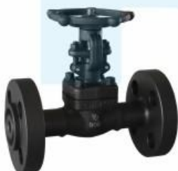
Forged steel flange gate valve