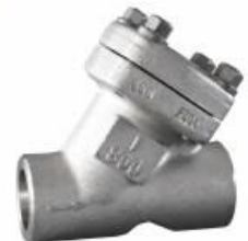
Forged steel butt welding Y-shaped filter