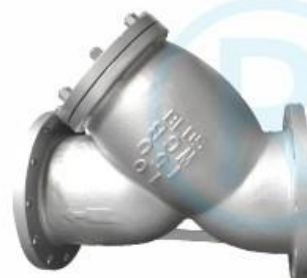
WCB API filter