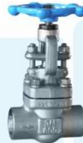
Forged steel butt welding globe valve