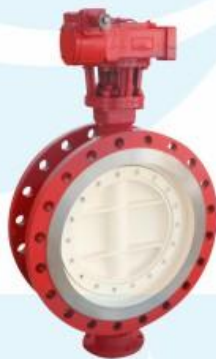
Flange butterfly valve 2"-48"•QT450 500 A216-WCB• PN16 150# GOST AWWAC504 API609 DIN3354 BS5155