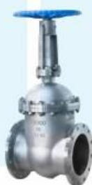
321 GOST Gate valve