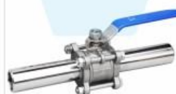
3PC extended stem ball valve