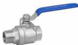
2PC inner and outer ball valve