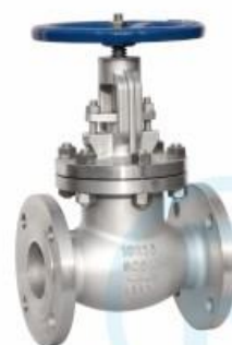
JIS Globe valve