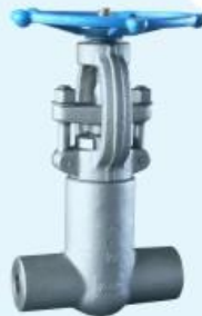
Forged steel self sealing socket welding gate valve