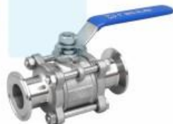
3PC quick installation ball valve