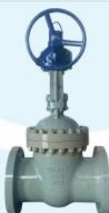
GOST Gate valve