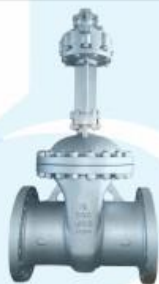
Gear opne gate valve