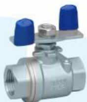
2PC Butterfly threaded ball valve