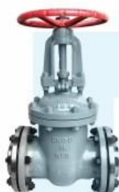
Wedge gate valve