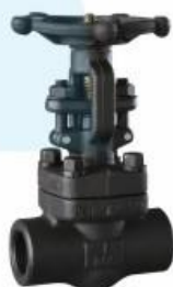
Forged steel threaded gate valve