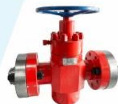
API6A gate valve

Material WCB WCC LCB CF8 CF8M CF3M WC6 WC9 C5 C11 C12 A105 LF2 F11 .....F22 F55