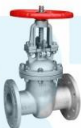
Cf8 GB Flange Gate valve