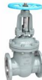
Cast Steel Gate valve