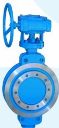
Clamping butterfly valve