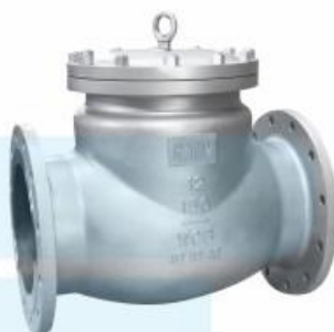
WCB API Flange check valve