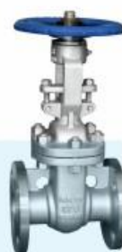
JIS Gate valve