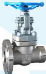
Forged steel non-standard gate valve