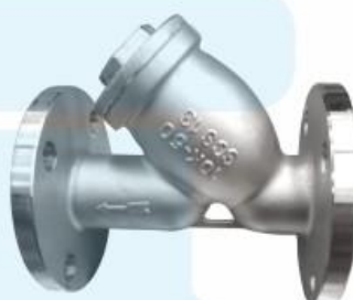
SCS13 JIS filter