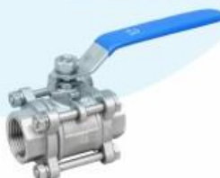
3PC threaded ball valve