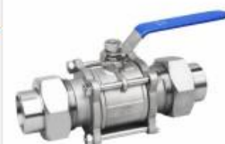
3PC welded ball valve