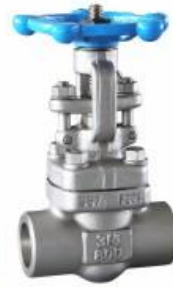
Forged steel butt welding gate valve