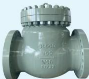
GOST Check valve