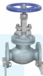
ANSI Globe valve