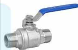
2PC inner and outer ball valve