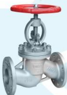
GOST Globe valve