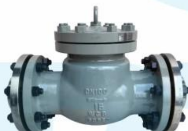
DIN /EN Check valve