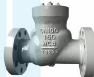
GOST Check valve